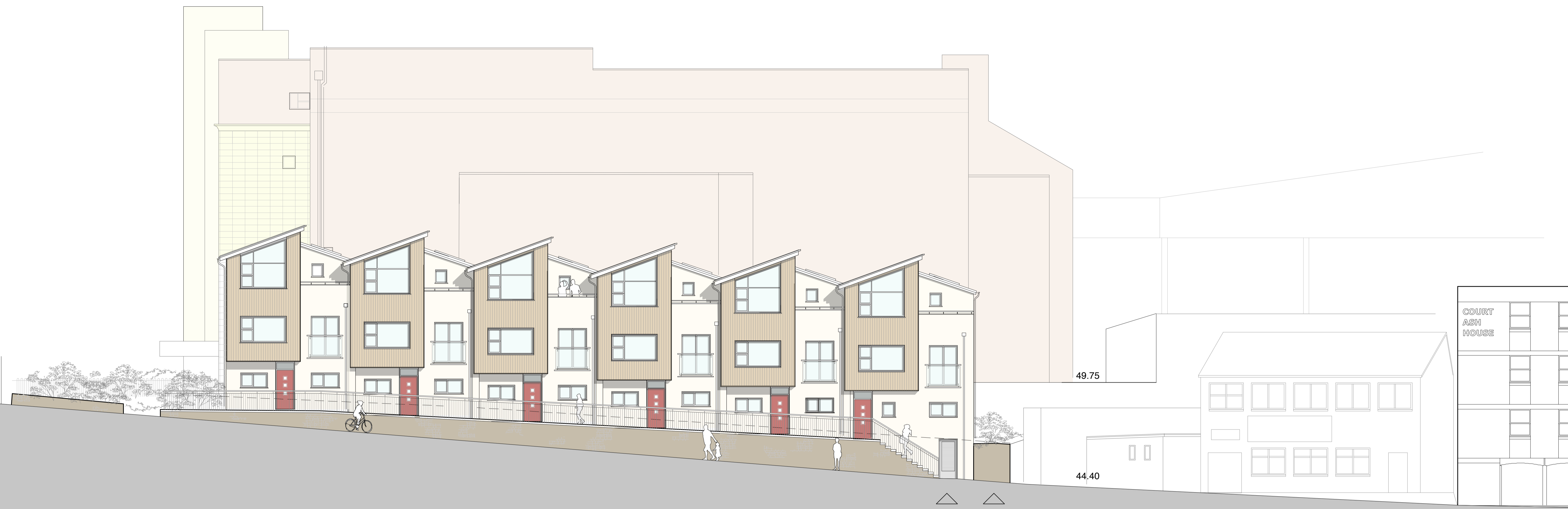
Southwest (Front) Elevation

Locked cycle and bin store undercroft Space reserved for future pedestrian link